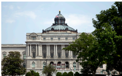
US Library of Congress

Copyright in the US and most of the world is automatic upon fixation of an original work of authorship in a tangible medium of expression. In plain English: you get copyright protection automatically when you put your original works on paper or in digital medium.